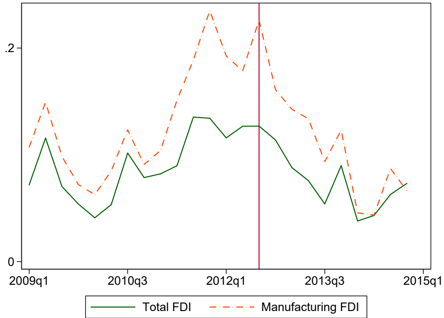
Figure 1. Share of Japanese FDI in China's Total Inward FDI

Note: The vertical line indicates 2012/Q3, the quarter in which the island crisis happened. Japanese quarterly FDI data are obtained from the Bank of Japan. Quarterly total FDI inflows into China are obtained from China Data Online. We partition the quarterly total FDI inflows into manufacturing and non-manufacturing FDI using their ratios in the yearly total FDI inflows.